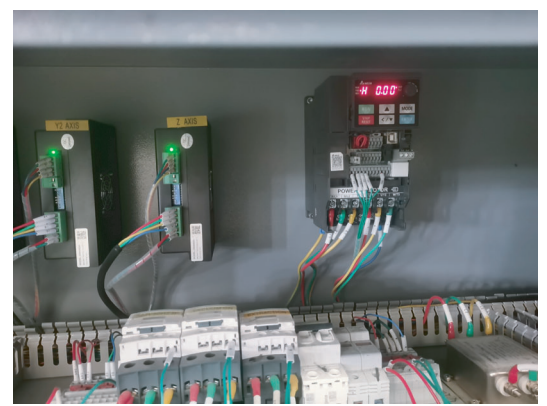
Industrial Control Cabinet